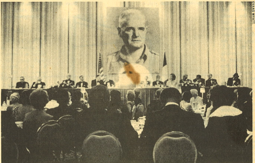
Beneath Wild Bill's portrait, OSS veterans fondly recall spying in a simpler age